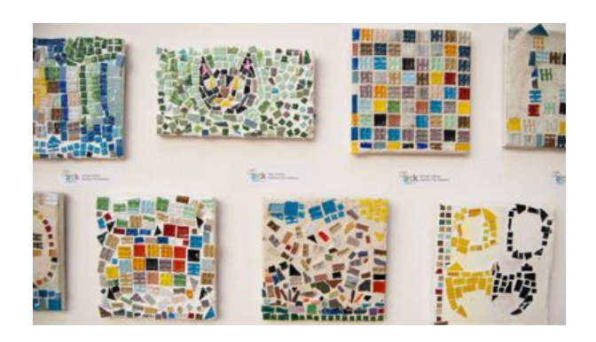
The SMFA featured Arabic calligraphy drawings from fifth and sixth graders at the Gardner Pilot Academy for the ARCK on Deck benefit last Thursday.

Academy (GPA) lined one wall in the main entrance of the School of the Museum of Fine Arts (SMFA) and the student's Arabic calligraphy work lined the opposite wall.